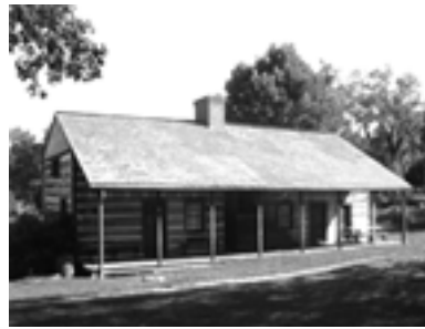
Exchange Place

December 12–14, Fri., Sat., & Sun.: 1818 Candlelight Christmas Party, Fri. & Sat., 7–9 p.m.; Sun., 2–4 p.m.