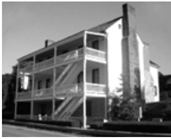
Netherland Inn